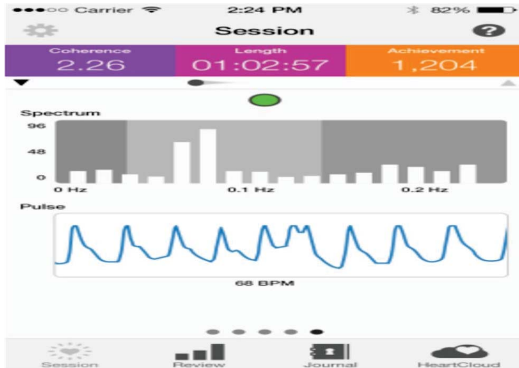
Figure 2: HeartMath Power Spectrum Technique ( https://heartcloud.com/manuals )

Figure 2 refers to a HeartMath Power Spectrum Technique, available in Inner Balance and emWave Pro tool, indicating increased activity around the 0.1 Hz frequency range, the coherence zone, accompanied by decreased activity in both lower (sympathetic) and higher, (parasympathetic) frequency ranges respectively.