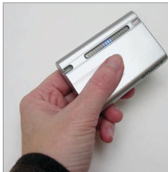
Figure 1 The emWave Personal Stress Reliever.

The sample investigated in this study was selected at random from the cardiac center registry at the Prince Sultan Cardiac Center in Hufuf, Saudi Arabia, for potential inclusion in the study. The inclusion criteria for hypertension were a systolic BP of greater than 140 or a diastolic BP of greater than 90. Sixty-two patients were recruited to participate in the study. Prior to the experiment, the examiner explained to the patients the aim of the study and the procedures they would be asked to participate in.